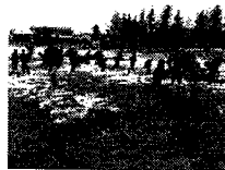
Lyman High School hosted an easter egg hunt for the K-4th grade. it was a lot of fun as we got to participate with the kids.